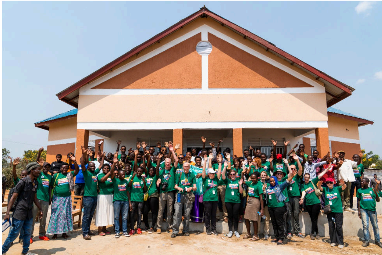
Nakivale Refugee Settlement community members & friends celebrate the official launch of the Atomic Data Nakivale Community Library Network, June 2019